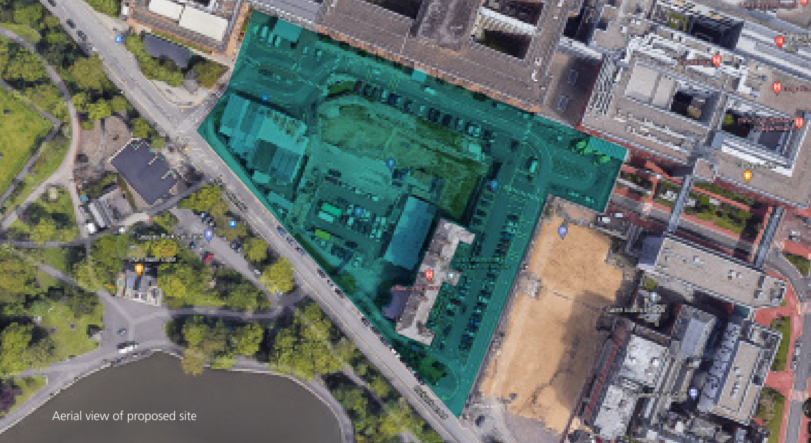
Aerial view of proposed site